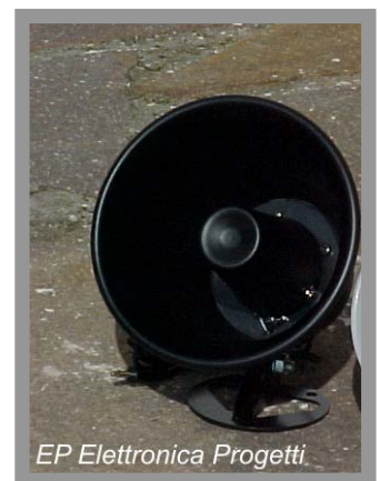
EP096AF - 8

E.P. Elettronica Progetti s.r.l. Via degli Oleandri, 47 00040 Ariccia (RM) Italy tel.: +39 06 9342181 Fax: +39 06 9344987