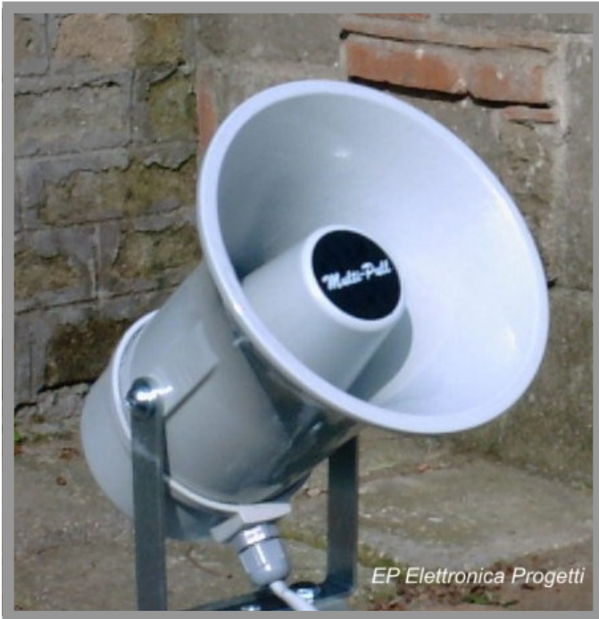
EP096AF - 40